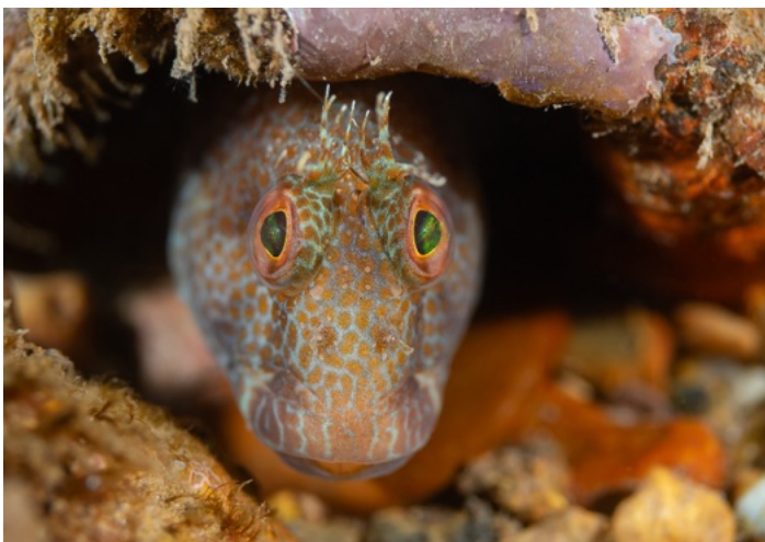
Dan's portfolio: (clockwise) Variable blenny, Babbacombe; Yarrell's blenny, Scotland; Butterfly blenny, Fal estuary