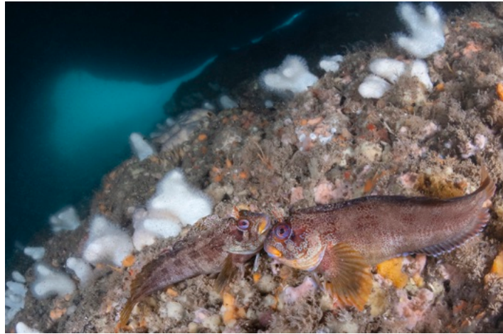
Kirsty's portfolio: Snooted blenny portrait, tompons battling and tompons with eggs