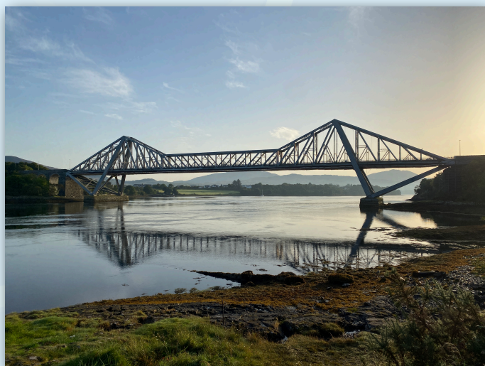
Top Right: Dead Man's Hole. Above: Connel Bridge. Below right: Abundant Anemone life. Below: Kitting up area.

The site itself is in the village of Connel, about 20mins north of Oban, and located in the shadows of Connel Bridge that spans Loch Etive. Famous for its insane tidal currents, standing waves, whirlpools and eddies, 'the falls' are generated when the tide level in the Firth of Lorn drops below (or rises above) the level of the water in Loch Etive.